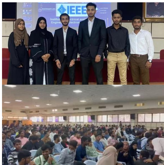
Induction Program Membership Drive by EDS EXECOM